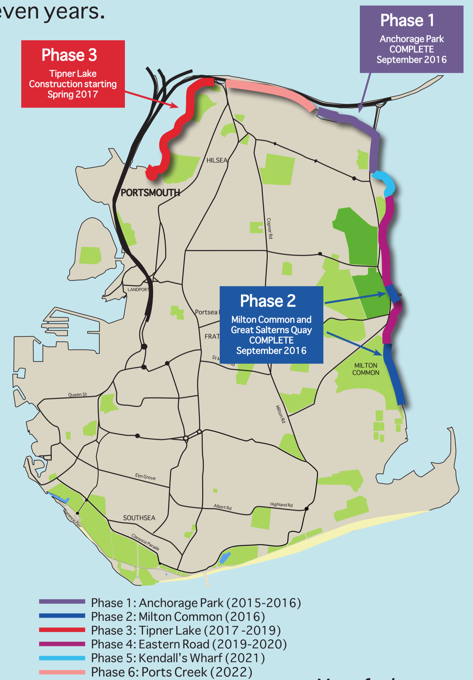
Map of scheme area

Construction works have been split into distinct phases which will be delivered over a period of seven years.